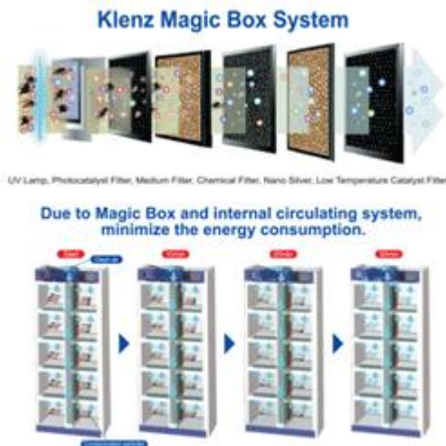
Magic Box System